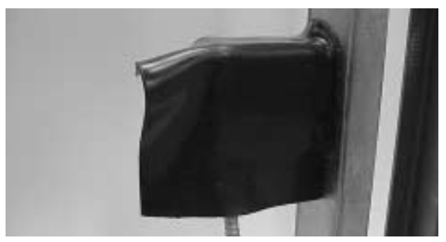
Step 3: Starting at top, align to front edge of box and overlap onto the stud 1/2 inch (13 mm).