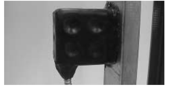
Step 6: Trim excess putty from corners and apply it to conduit fittings or cables connected to the box. Ensure pad is pressed firmly to surface of top, back, bottom, and side of box.

Warranty and Limited Remedy. This product will be free from defects in material and manufacture for a period of ninety (90) days from date of purchase. 3M MAKES NO OTHER WARRANTIES INCLUDING, BUT NOT LIMITED TO, ANY IMPLIED WARRANTY OR MERCHANTIBILITY OR FITNESS FOR A PARTICULAR PURPOSE. User is responsible for determining whether the 3M product is fit for a particular purpose and suitable for user's method of application. If this 3M product is proved to be defective within the warranty period stated above, your exclusive remedy and 3M's sole obligation shall be, at 3M's option, to replace or repair the 3M product or refund the purchase price of the product. Limitation of Liability. Except where prohibited by law, 3M will not be liable for any loss or damages arising from the use of this 3M product, whether direct, indirect, special, incidental or consequential, regardless of the legal theory asserted, including warranty, contract, negligence or strict liability.