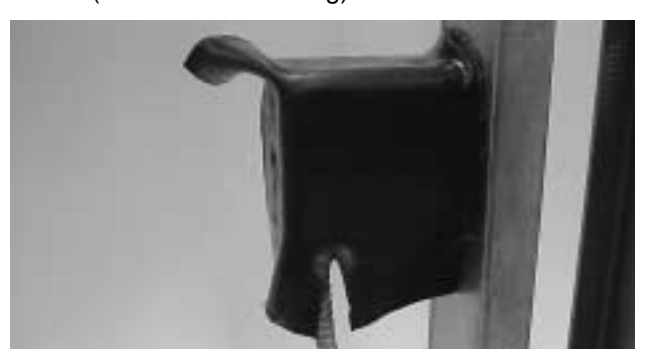
Step 4: Adhere remaining pad to box and cut to provide a snug fit around conduits or cables.