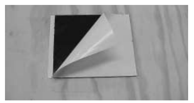
Step 1: Remove liner from both sides of pad.

Refer to the Wall Opening Protective Material (CLIV) listing in either the 3M Fire Protection Products Applications and Specifiers Guide or the UL Fire Resistance Directory Volume 1 for MPP+ Moldable Putty Pad application on UL Listed metallic and nonmetallic outlet boxes. No special skills or tools are required. To ensure adequate adhesion, all surfaces shall be clean and free of dust, grease, oil, loose materials, rust or other substances.