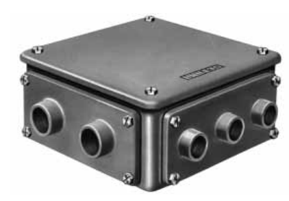
RS Box bottom and side frame construction is one piece malleable iron. Smooth hub cover openings prevent damage to conductor insulation.