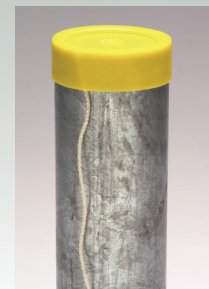
(String can be used to aid removal.)