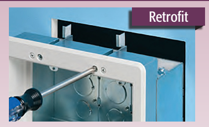
Cut a hole using enclosure without trim plate, as template. Mounting wings hold box in wall.