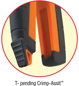
foot provides stability when work suface liverage is needed to crimp larger connectors.