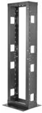
Extra Deep Relay Rack HHR45U10