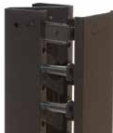
Z-Channel Manager, Hinged