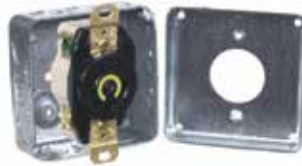
Power Kit ICKP20