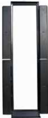
Rack with Vertical Cable Managers CS1976H