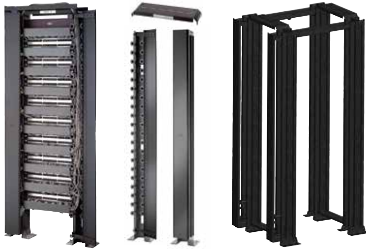
Column (Door Open, Closed) IS7