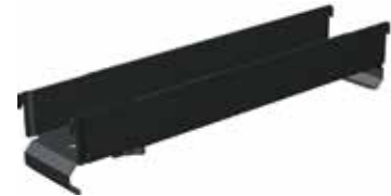
4-Post Rack Kit ISK4P