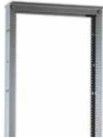
Standard Relay Rack HPW84RR19