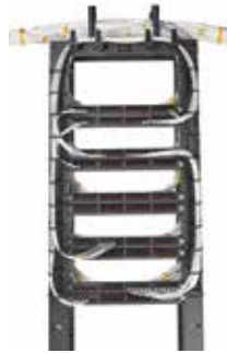
Wire Manager VC8024