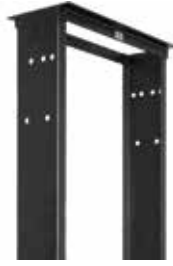
Deep Relay Rack HPW84RR19D