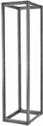
Relay Rack, Angled SF8419xx