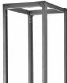
Relay Rack, Angled SF8419xx