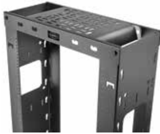
Extra Deep Relay Rack, Top View