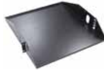
Center Weighted MCCCS19