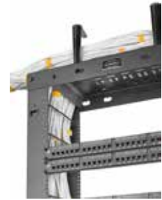
Wire Gates Installed