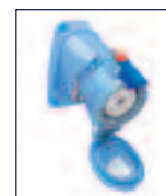
Female Receptacle with Angle Adapter 63-34043 + 61-3A027