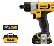
12V MAX* 1/4" Screwdriver Kit