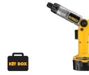
1/4" (6.35mm) 7.2V Cordless Two-Position Screwdriver Kit