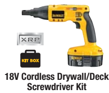
18V Cordless Drywall/Deck Screwdriver Kit