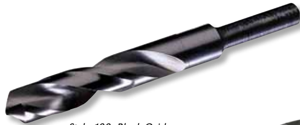
Style 190 Black Oxide with Round Shank