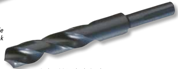
Style 190F Black Oxide with Flatted Shank