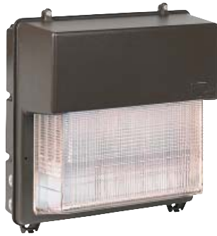
Wall Pack Luminaires