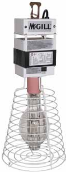
Shown with optional bottom trap