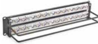
48-Port Patch Panel, Rear View HP648