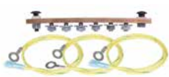
Grounding Kit REKGB