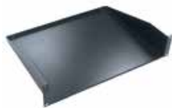
Equipment Shelf MCCCS19