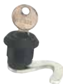
Locking Kit CKL333