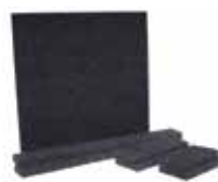
Sound Dampening Kit REKS