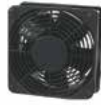
Fan Kit REKF