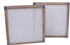
Dust Filter HWKFF