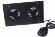
Fan Kit with Tray HWKF120