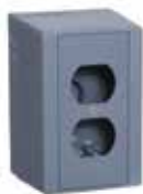
DIN Rail Kit HIDRUBCKIT