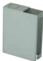
Fiber Optic Bracket REKFP