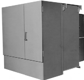
Liquid Filled Pad Mounted