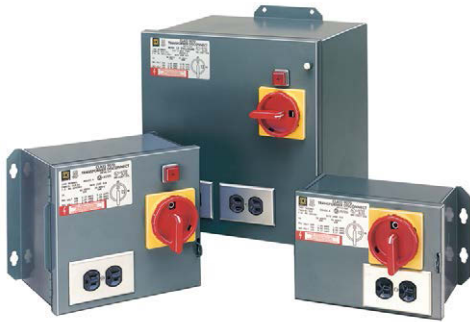
Transformer disconnects are available in NEMA Type 1 Standard, NEMA Type 12 Standard, and NEMA Type 1 Mini.