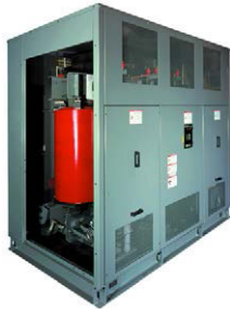
Power Cast II™

New! Revised Medium Voltage Transformer Energy Efficiency Information For 2016! In 2010 Schneider Electric released new efficiencies for MV transformers based on The Department of Energy (DOE) 10 CFR Part 431 Energy Conservation program for Commercial Equipment. We are now launching even more efficient transformers to further reduce energy consumption from MV transformers. Starting January 1, 2016 certain medium voltage distribution transformers with ratings of 2,500 kVA and below, 34.5 kV primary and below and 600 Vac class secondary voltages must meet revised minimum efficiency requirements. Liquid Filled Padmounts, Liquid Filled Substations, Dry Type VPI and Power Cast products shipped after January 1, 2016 will all be included. The minimum efficiency tables are listed below. Please contact your nearest Schneider Electric Sales Office for more information. Page 14-19 and 14-20 includes our updated offer.