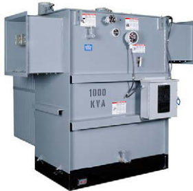
Liquid Filled Substation