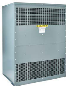
General Purpose Dry Type 600 Volts and Below