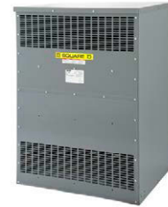
Style J—Type 2 Rated Converts to Type 3R with Weathershield