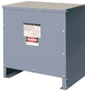
Style E—IP55 Rated

These dimensions are not for construction. Contact your local Schneider Electric representative for certified prints.