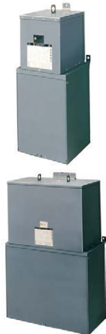
Table 14.12: Plug On Circuit Breakers

The Mini Power-Zone unit substation uses a separate transformer and panel section. This allows the panel section to be removed and wired first if desired. Also the transformer can be replaced without disturbing the panel section and associated wiring. The new transformer simply slides into the top of the panel section and primary and secondary leads are reconnected to the main circuit breakers.