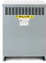
Style K—Type 2 Rated Converts to Type 3R with Weathershield