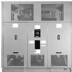
Power Dry II™