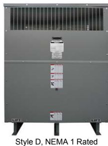
Style D, NEMA 1 Rated

Special outdoor construction required for NEMA 3R applications. Contact your local Schneider Electric sales office for details.