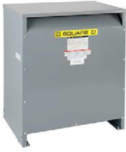
Style D and H—Type 2 Rated Converts to Type 3R with Weathershield