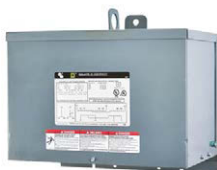
Type T and Type TF