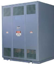
Style F—NEMA 1 Rated