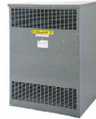
Style J—Type 2 Rated Converts to Type 3R with Weathershield