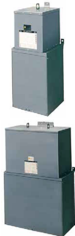
Table 14.12: Plug On Circuit Breakers

The Mini Power-Zone unit substation uses a separate transformer and panel section. This allows the panel section to be removed and wired first if desired. Also the transformer can be replaced without disturbing the panel section and associated wiring. The new transformer simply slides into the top of the panel section and primary and secondary leads are reconnected to the main circuit breakers.