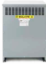
Style K—Type 2 Rated Converts to Type 3R with Weathershield