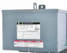
Type T and Type TF