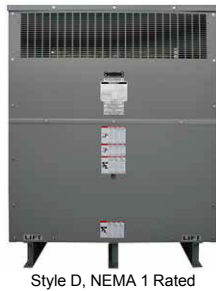
Style D, NEMA 1 Rated

Special outdoor construction required for NEMA 3R applications. Contact your local Schneider Electric sales office for details.