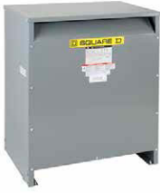
Style D and H—Type 2 Rated Converts to Type 3R with Weathershield