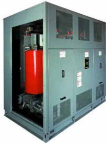
Power Cast II™

New! Revised Medium Voltage Transformer Energy Efficiency Information For 2016! In 2010 Schneider Electric released new efficiencies for MV transformers based on The Department of Energy (DOE) 10 CFR Part 431 Energy Conservation program for Commercial Equipment. We are now launching even more efficient transformers to further reduce energy consumption from MV transformers. Starting January 1, 2016 certain medium voltage distribution transformers with ratings of 2,500 kVA and below, 34.5 kV primary and below and 600 Vac class secondary voltages must meet revised minimum efficiency requirements. Liquid Filled Padmounts, Liquid Filled Substations, Dry Type VPI and Power Cast products shipped after January 1, 2016 will all be included. The minimum efficiency tables are listed below. Please contact your nearest Schneider Electric Sales Office for more information. Page 14-19 and 14-20 includes our updated offer.