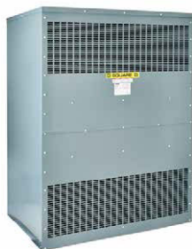
General Purpose Dry Type 600 Volts and Below