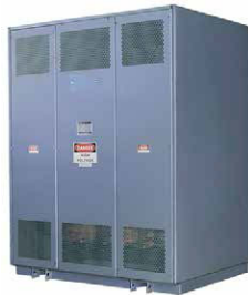
Style F—NEMA 1 Rated