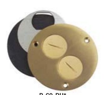
P-60-DU* Duplex 1-7/16 in. lid