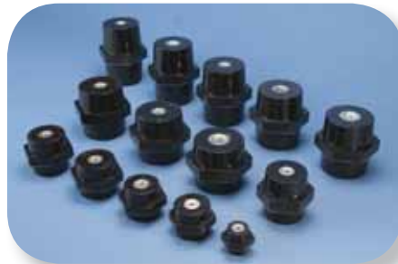
ERIFLEX® Low Voltage Insulators