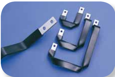
ERIFLEX® FLEXIBAR The Best Flexible Solution