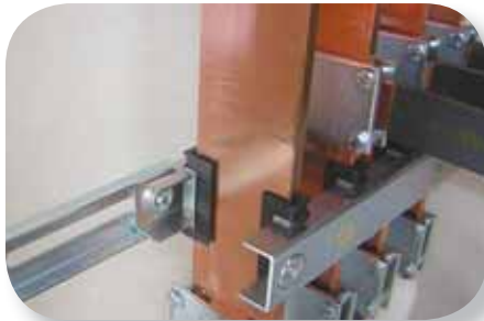
ERIFLEX® Busbar Systems

ERIFLEX® offers a complete solution of Power Distribution Products into Wind Turbine Nacelle