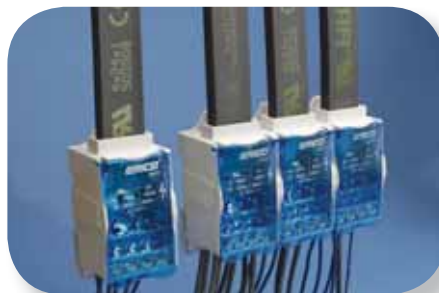
ERIFLEX® Power Distribution Blocks